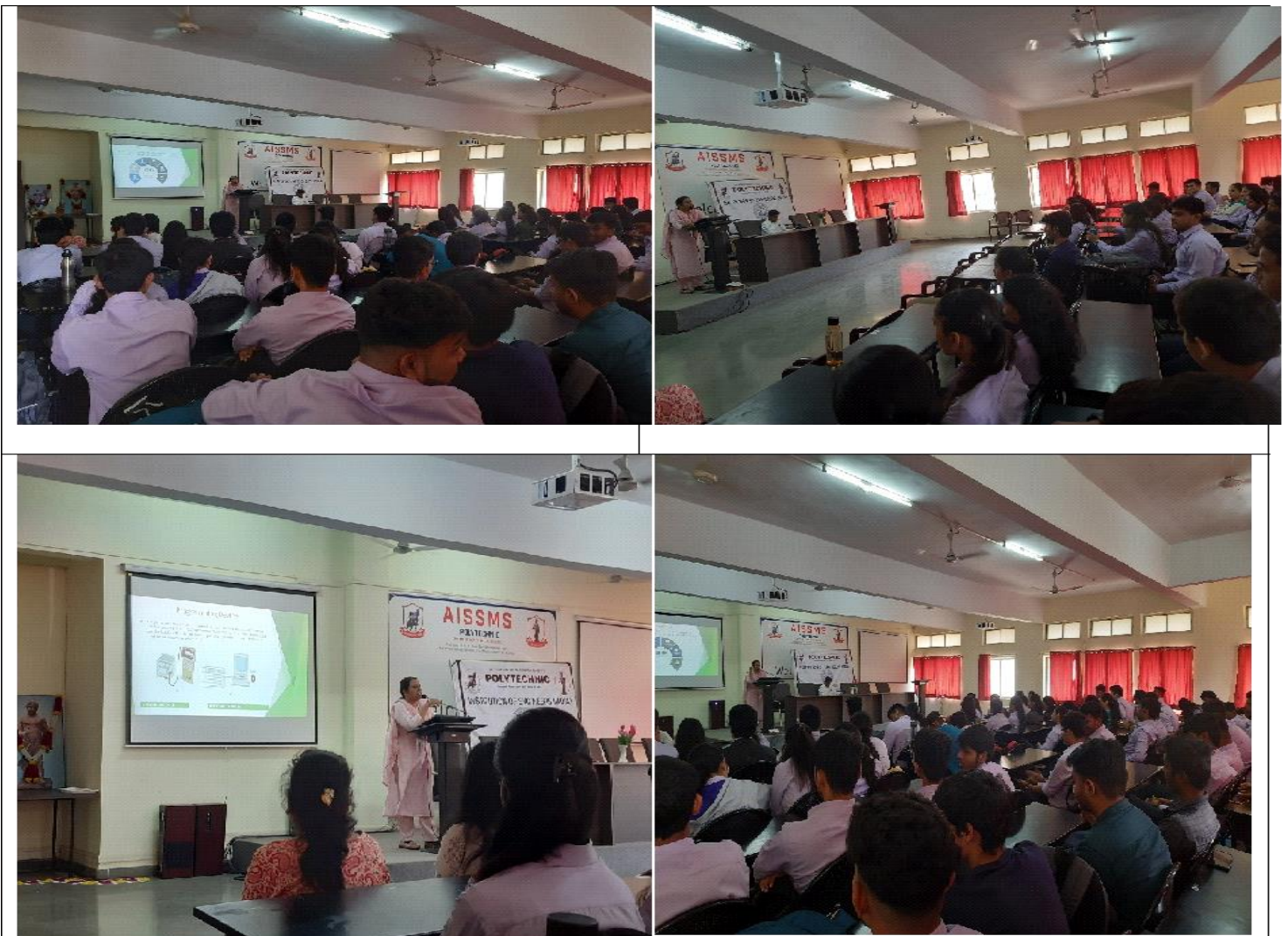
Monday, 11-09-2023, Guest Lecture on “Advancement in Industrial Automation”