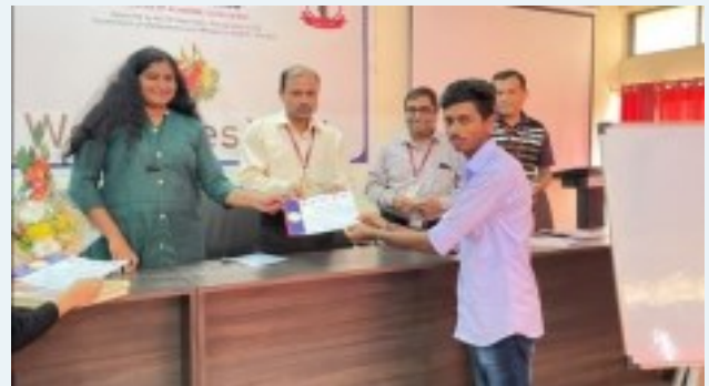
Valedictory Function & Distribution of Certificates