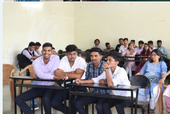
Photo for Quiz Competition