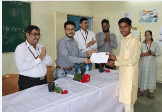
First winner in Essay Competition