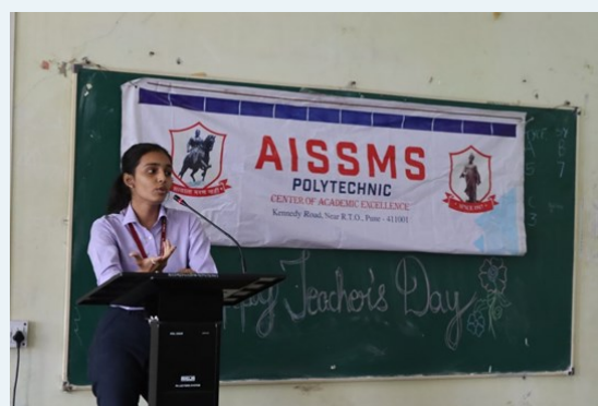
Photo for Debate Competition