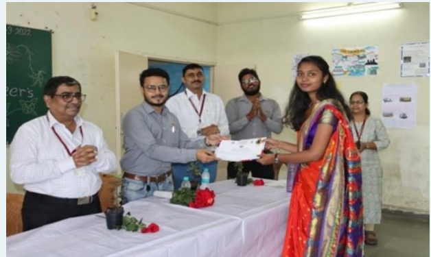
Distribution of Certificates