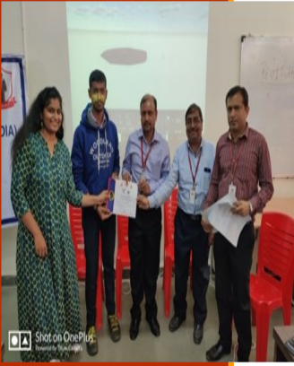
Add On workshop on "Revit architecture software"