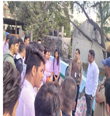
Site Visit SOLID WASTE MANAGEMENT, YERWADA