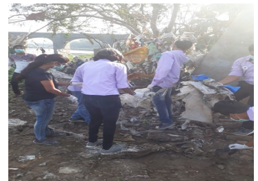
The Students of civil engineering department cleaning the river bank of Mutha River.

recreational activities along rivers clean and safe walk and run trails for the community. As recreational activities increases, tourists