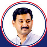
Shri. Sambhajiraje Chhatrapati Vice President, AISSM Society