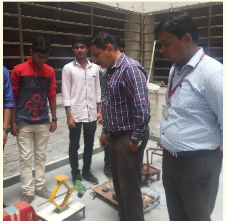
Final Year Students “Project Exhibition Competition”