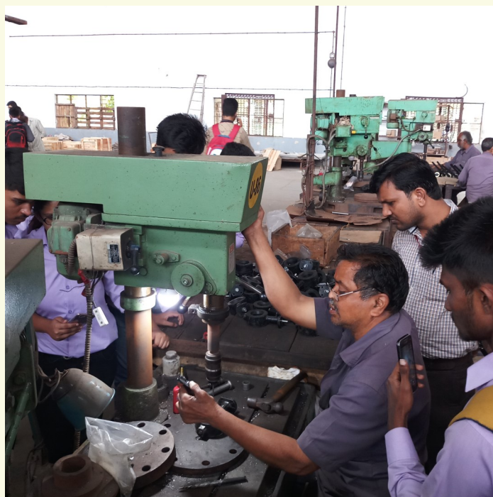
Industrial Visit at 'Dr. Meenu Mehata Apang Udhkar Kendra', Pune