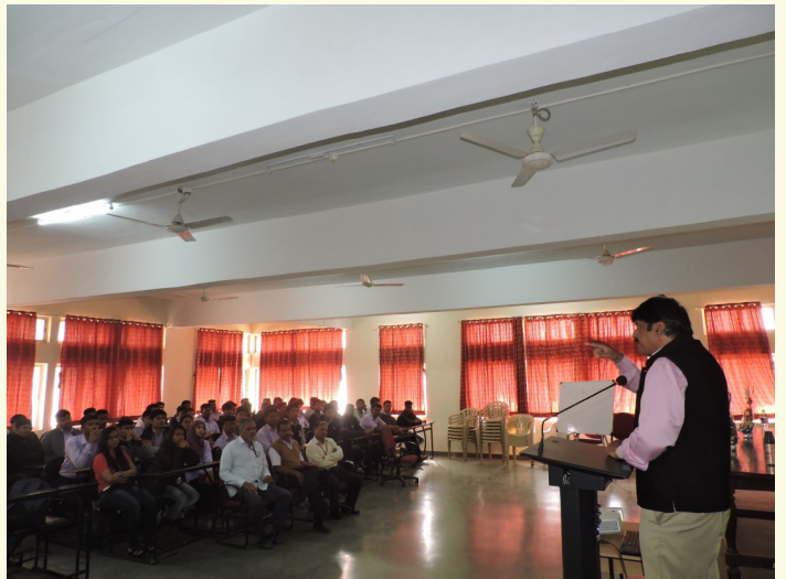
Seminar conducted on “Entrepreneurship development programme”