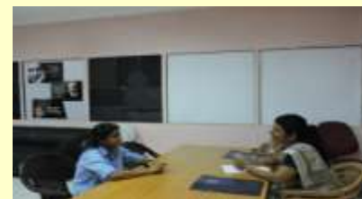
Student Counseling by IHHI, Pune

The staffs of our institute are given proper counseling for doing their work effectively and to live life stress free. These sessions also help staff to live in peace and harmony with others at the institute.