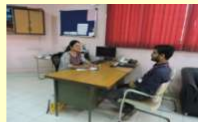
Staff Counseling by IHHI, Pune