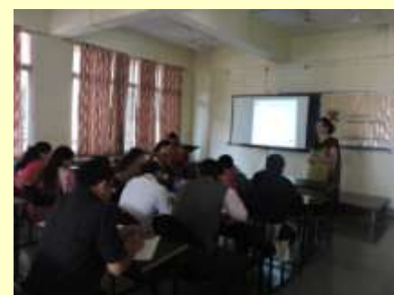
Personality Development program for staffs by IHHI, Pune

For the faculty motivation we have conducted personality development program on Team Building, Leadership, and Time Management for Teaching and Non-teaching staff.