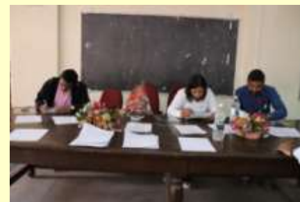
Placement Drive by KSB Pumps