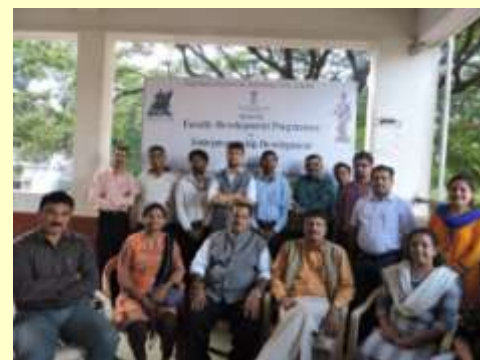
EDP Program by DST