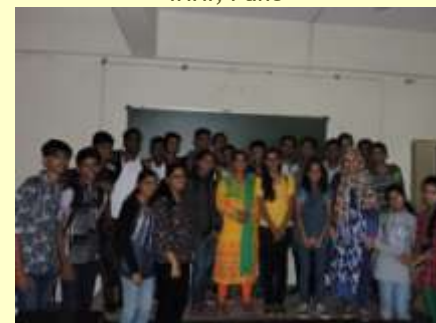
Personality Development program for Students by IHHI, Pune